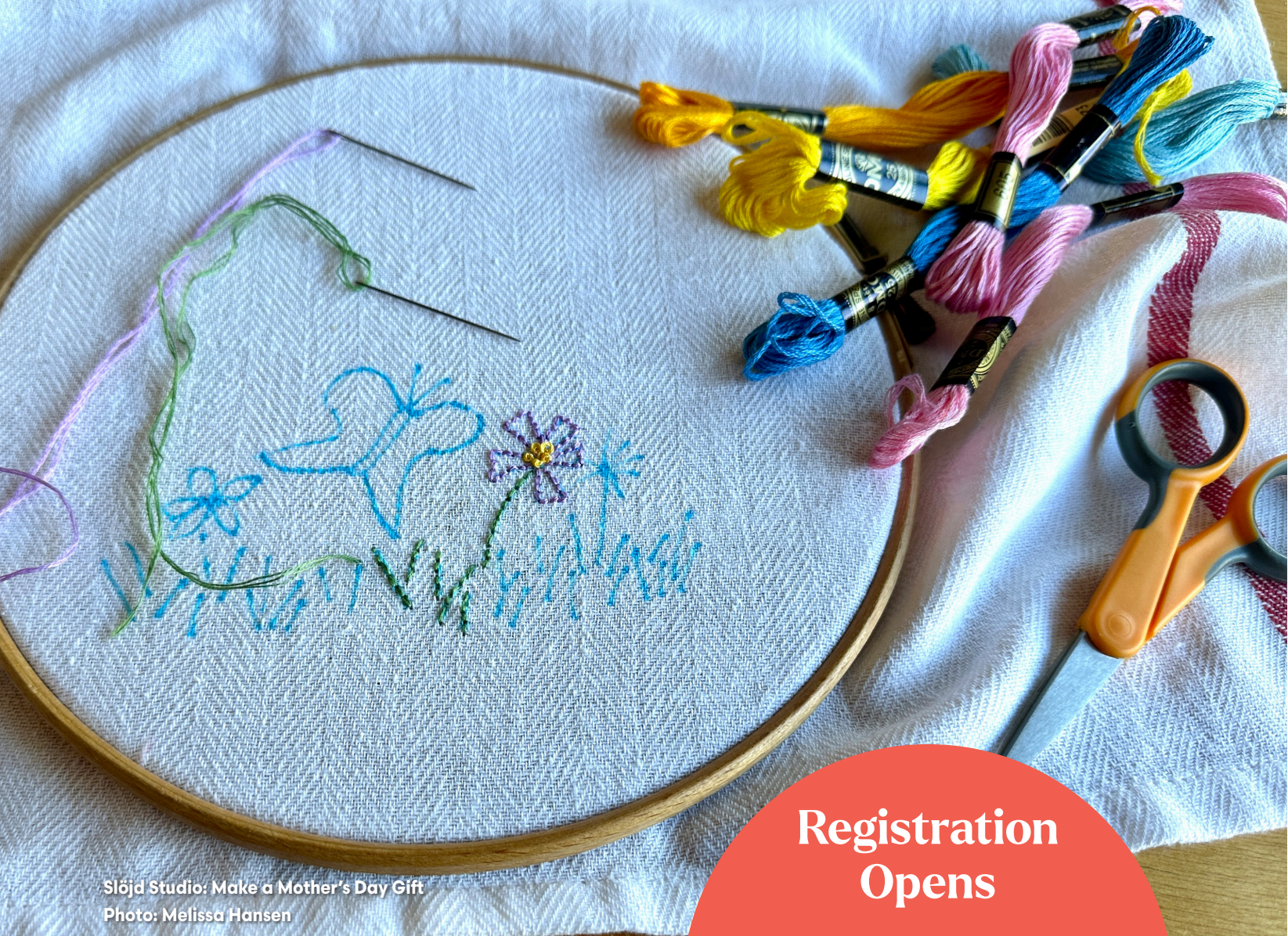
Slöjd Studio: Make a Mother's Day Gift