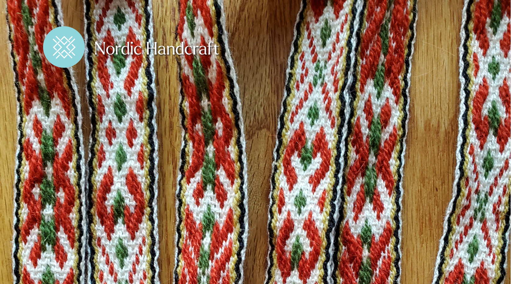
Backstrap Band Weaving with Caroline Feyling