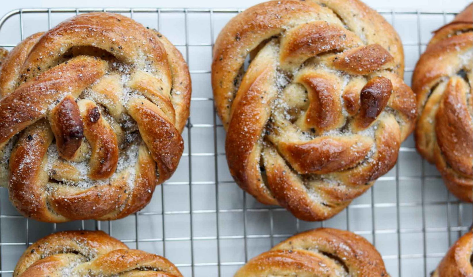
Swedish Cardamom Buns with Kristi Bissell