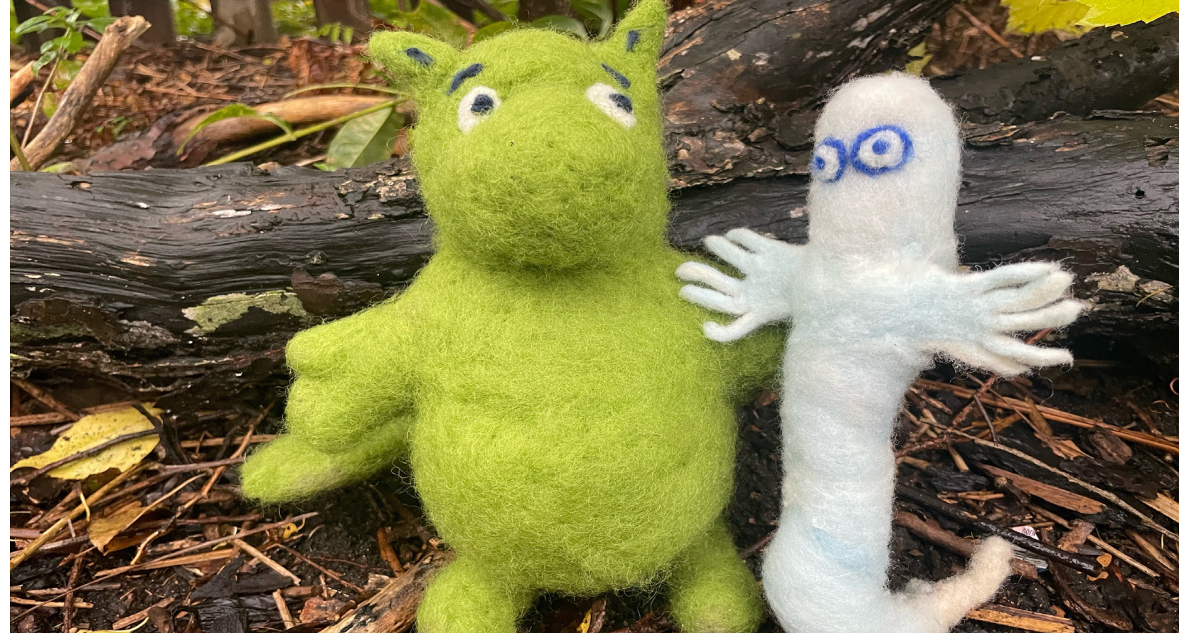
Wet Felted Sculptural Moomin with Elise Kylo

Design your own floral kurbits (flower motif) inspired by folk painting in the Swedish region of Dalarna!