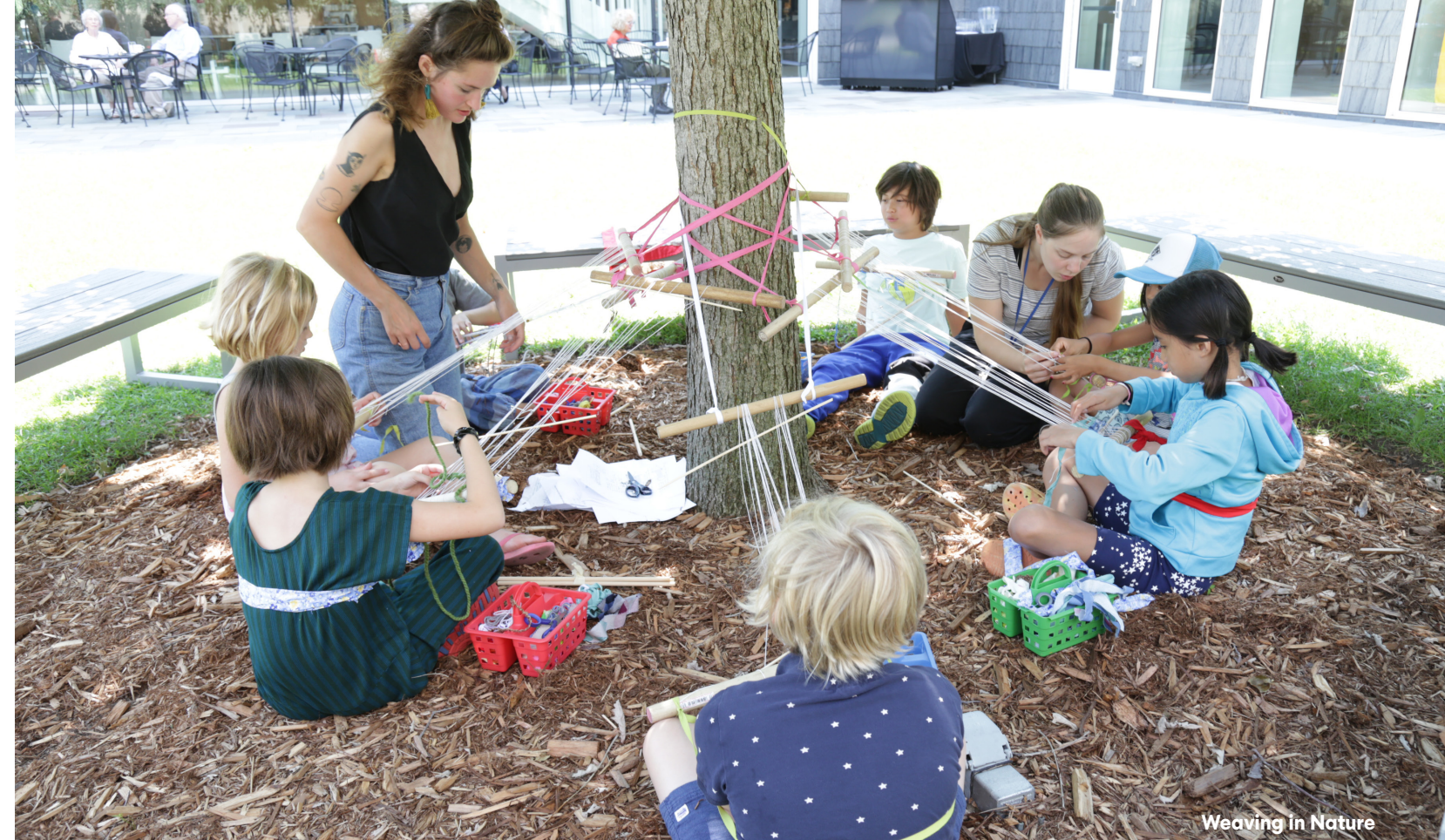
Weaving in Nature

Inspired by ASI’s exhibition, Karin Larsson: Let the Hand be Seen , the instructor will introduce students to the art of tapestry weaving. Young makers will use textile and natural materials to create small works of art. This class will take place outside. Students must wear clothing appropriate for outdoor play and messy art projects.