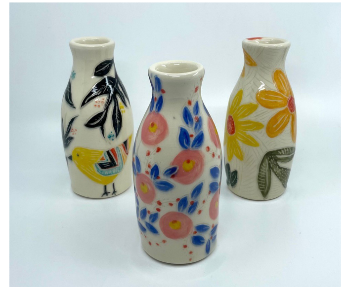
Carve and Paint a Ceramic Vase with Kim Burnham

Deck out your fairy garden with mushrooms, creatures, gnomes, and more! Students of all ages are invited to make a dozen tiny clay decorations perfect for tucking in a potted plant or fairy garden. After students build and paint their creations with colorful underglazes, the projects will be fired in the instructor's home studio and returned to ASI for pick up. Suitable for ages 18+ or ages 9–17 accompanied by a registered adult. $50 ($45 ASI member) + $10 materials fee payable to instructor