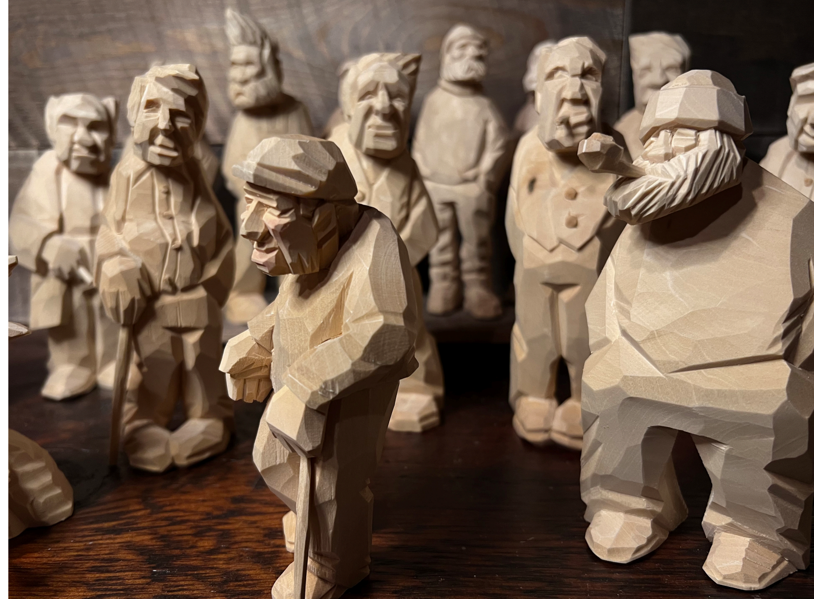
Scandinavian Figure Carving with Charles Banks

Carvers of all experience levels are invited to join this three-day flat plane figure carving class. Using just a knife, students will carve a Nordic-inspired character in a simplified, traditional style. Students can expect plenty of discussion about the history of figure carving and notable carvers while finishing one or two carvings. Moderate hand strength and dexterity required. Suitable for ages 16+. $250 ($225 ASI member) + $10 materials fee per blank payable to instructor