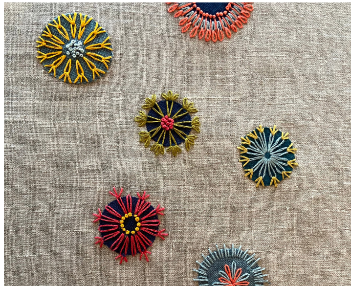
Embroidered Linen Sampler with Judy McDowell

It's time for jul i juli , Christmas in July! Chill out by making a woolly little snowman perfect for imaginative play in this intergenerational needle felting class. Kids and their special adults will shape and decorate a pocket-sized snowman complete with a face and accessories using the magical technique of needle felting. Suitable for ages 9–17 alongside an adult. $50 adult/child pair ($45 ASI member adult/child pair) + $25 materials fee payable to the instructor