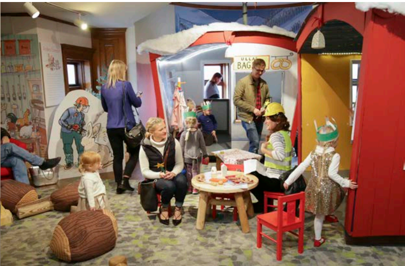
ASI Family Gallery: Ulla's Bakery