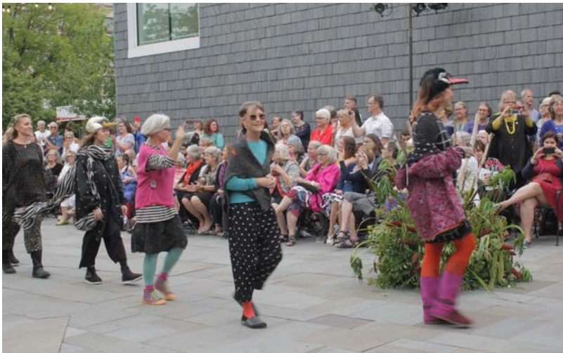
First Look: Gudrun Sjödén — A Colorful Universe