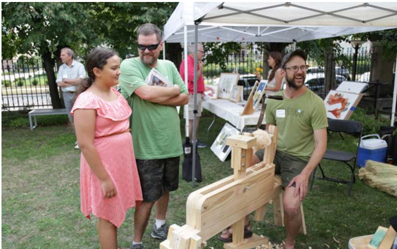
Great Makers Exchange