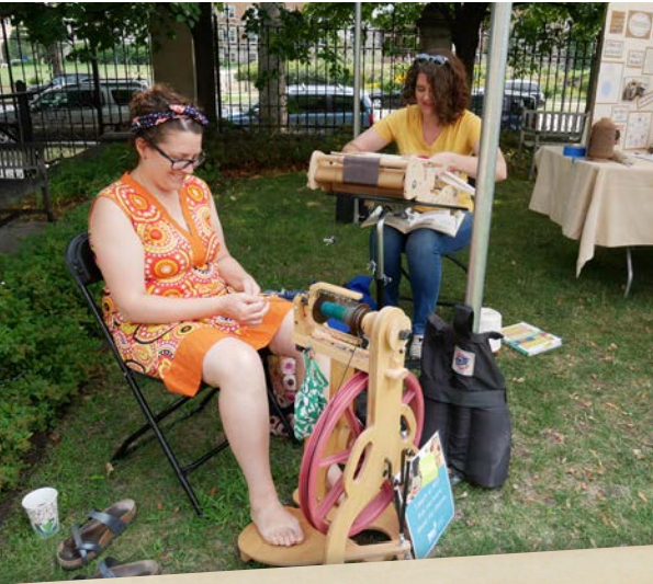
Great Makers Exchange