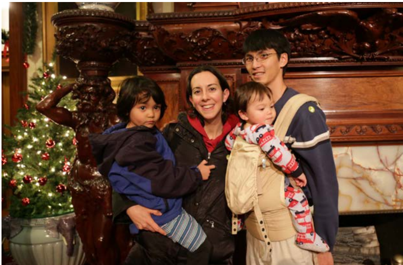
Family in Grand Hall during Julmarknad