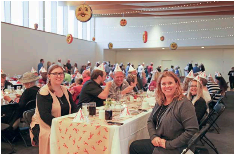
Kräftskiva — Crayfish Party