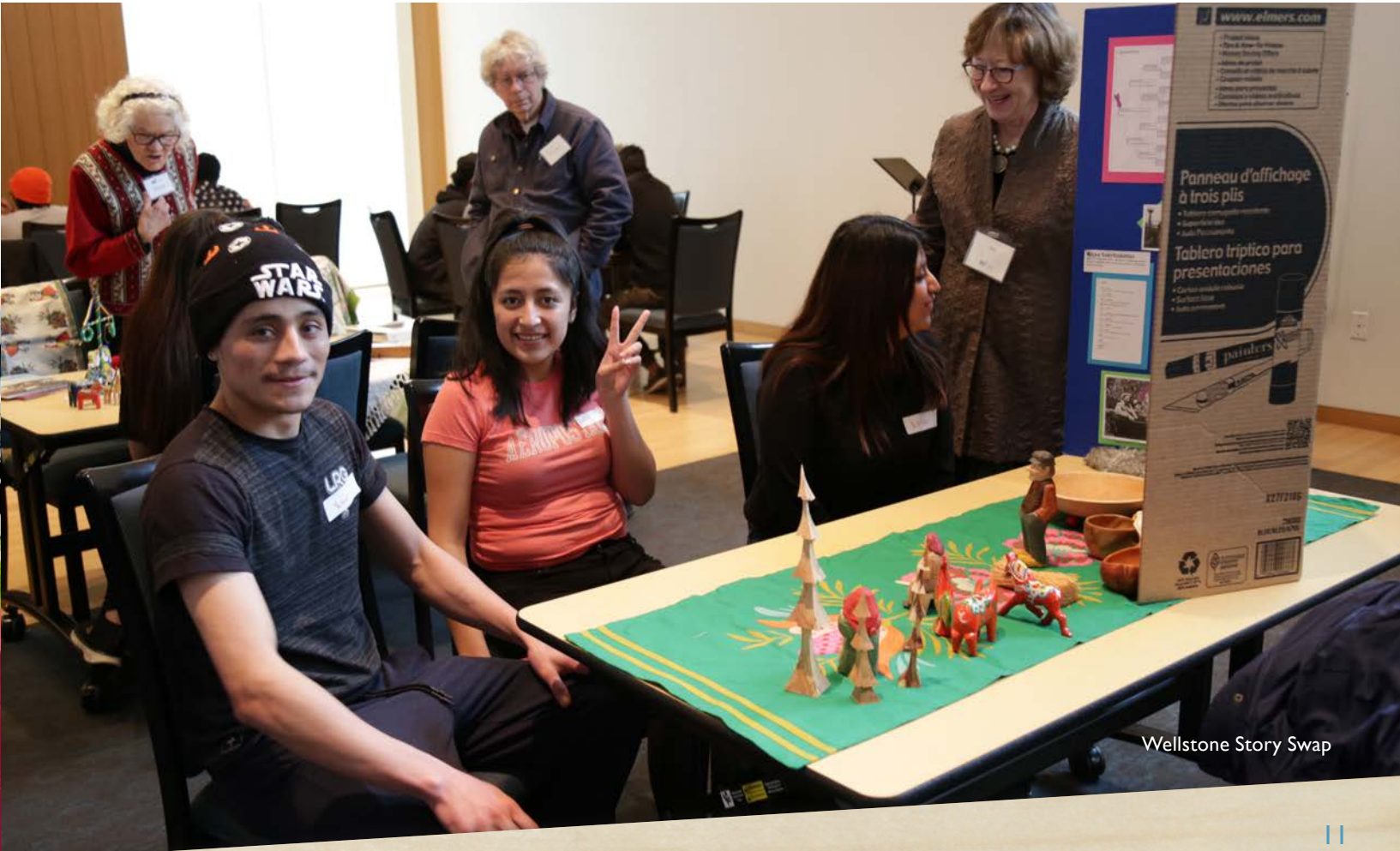
Wellstone Story Swap