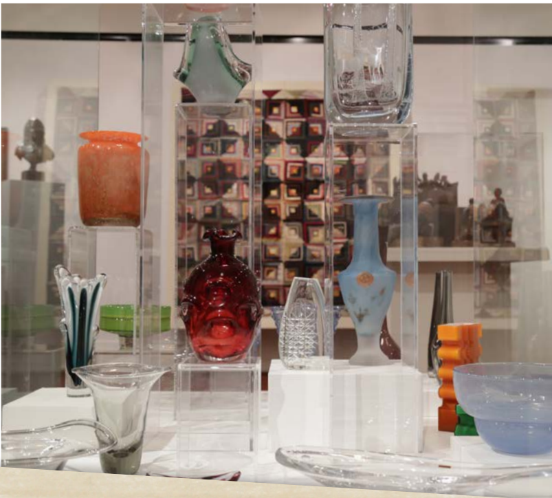
Swedish glass art from the 2018 exhibition Recent Acquisitions