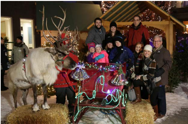
Winter Solstice Celebration