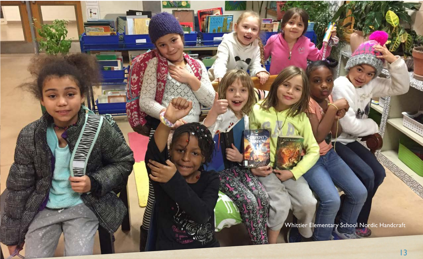
Whittier Elementary School Nordic Handcraft