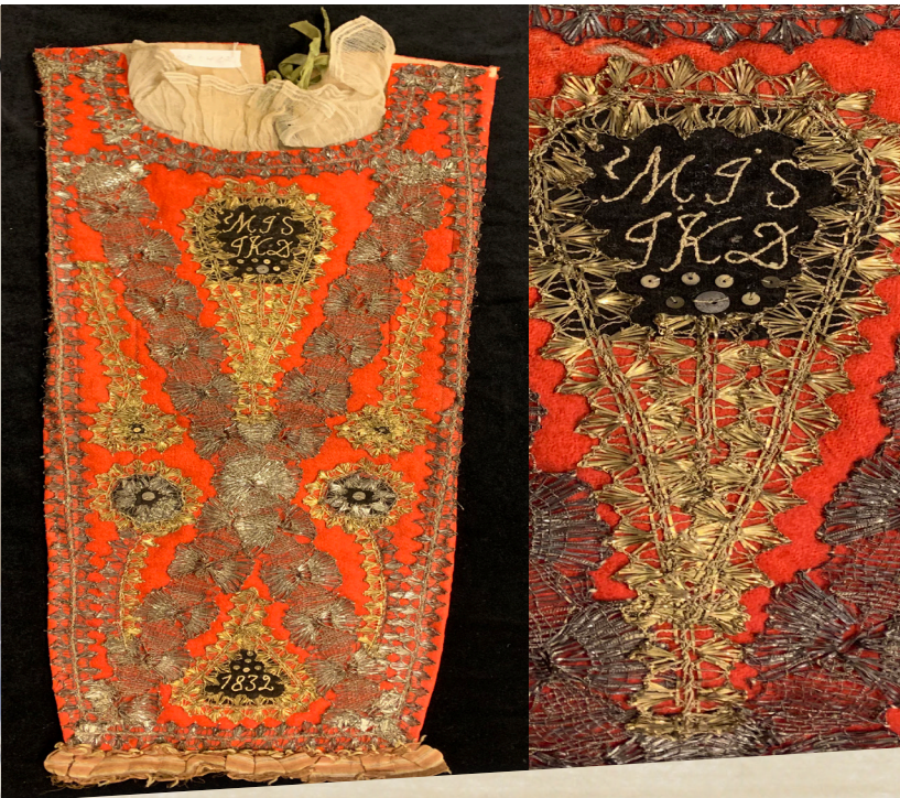
1832 Swedish baptismal gown