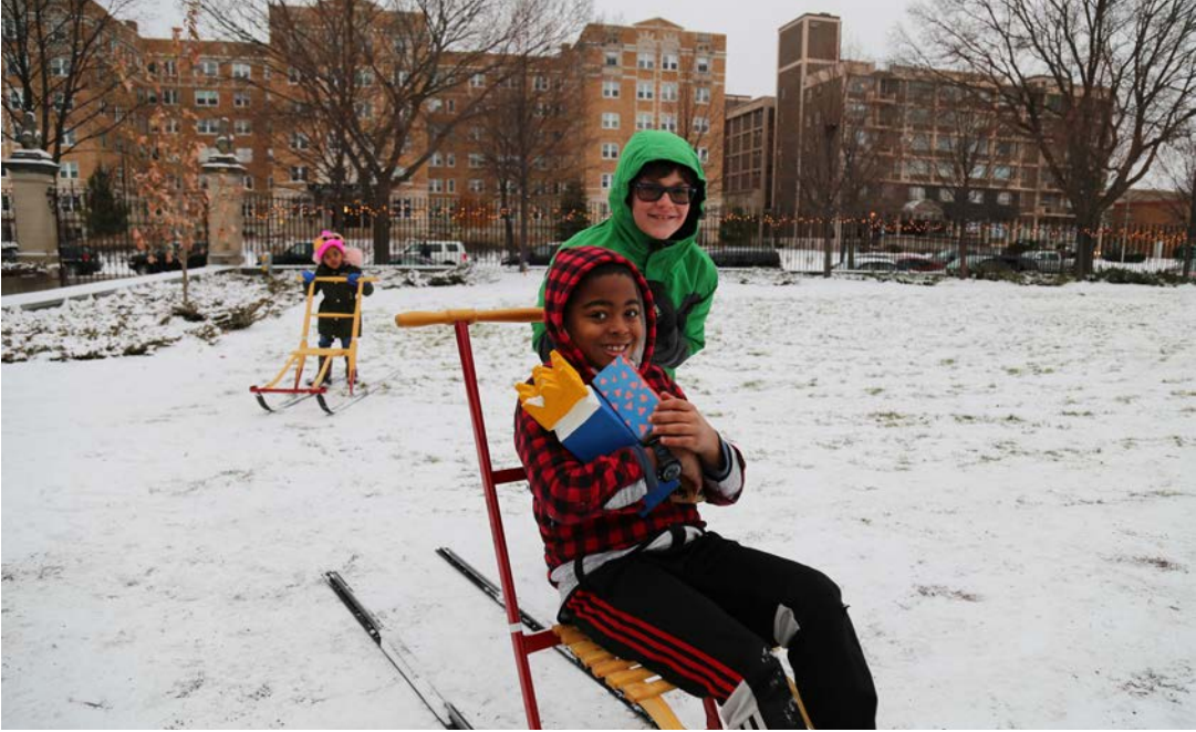
Neighborhood Open House