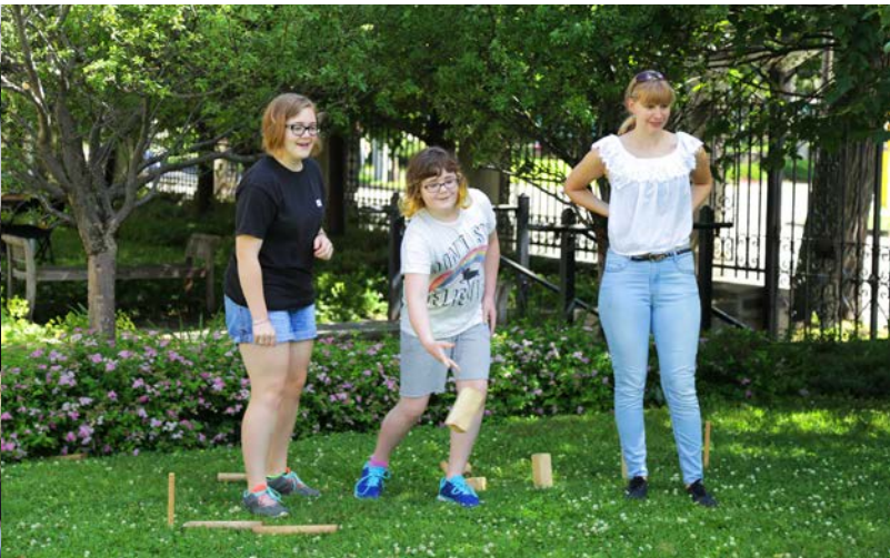
Kubb in the Courtyard