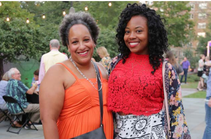
Cocktails at the Castle