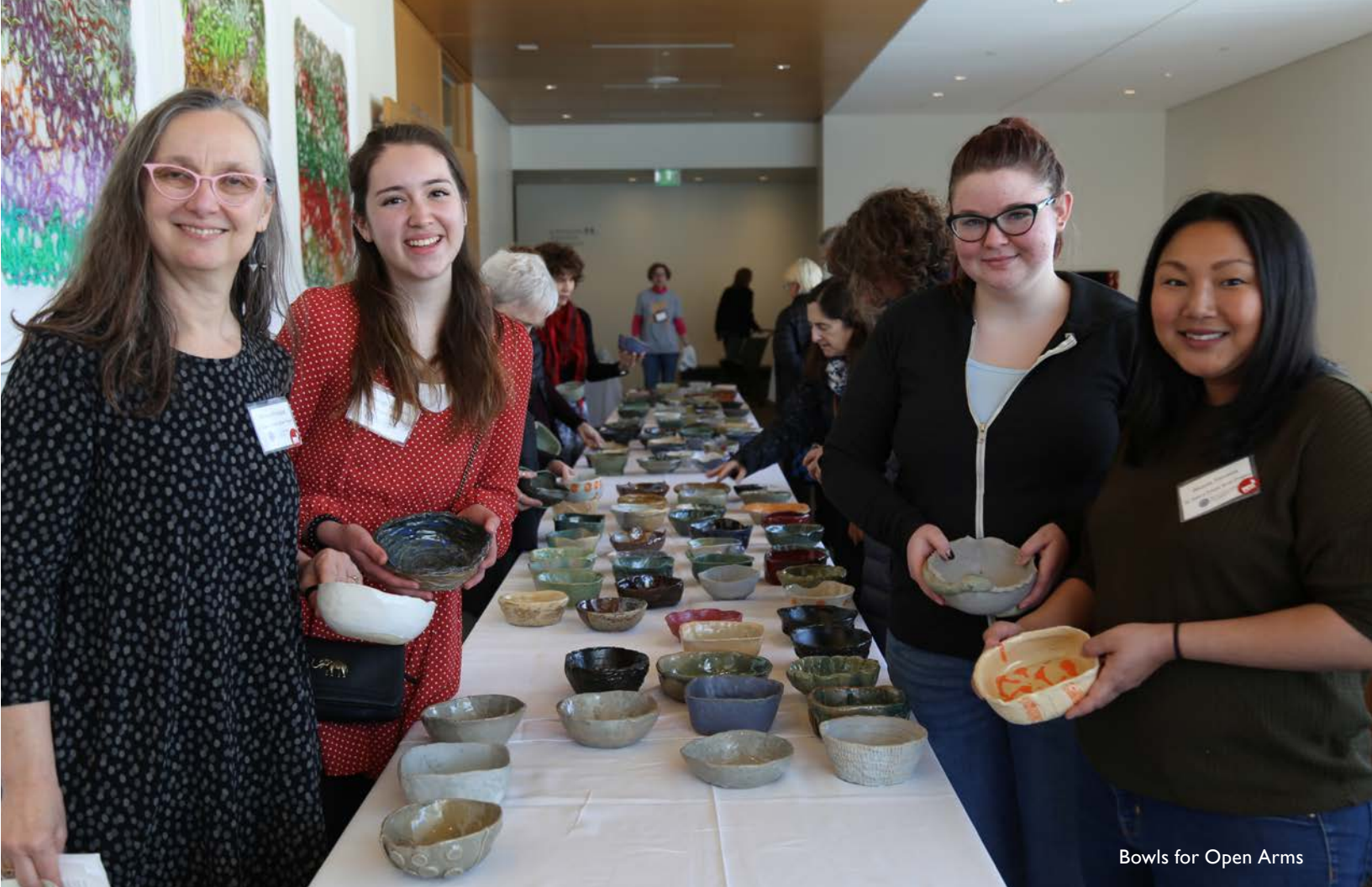
Bowls for Open Arms

Residents of Ebenezer Senior Living's buildings in the Phillips West neighborhood visited ASI often to participate in hands-on craft programs and to attend ASI's ongoing events. Some notable examples included watercolor and pottery classes and helping to create ceramic bowls for the Bowls for Open Arms soup benefit. ASI is grateful to have such a strong neighborhood partner in Ebenezer and to be able to connect Ebenezer residents with arts and cultural experiences.