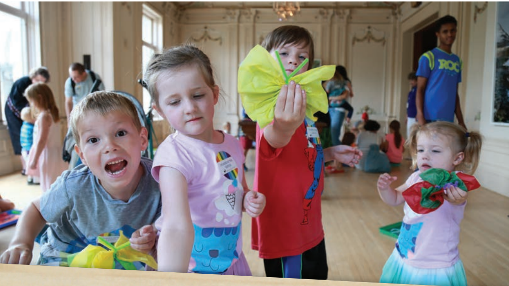
Kids at the Castle (BELOW)

Svenska Skolan , ASI's language and culture program for children ages 4 – 13, continues to grow. Children engaged in "A Year in Sweden," learn about the country's geography and customs. Kids at the Castle continues to attract families eager to explore the Turnblad Mansion, have fun together indoors and outside and maybe get a little dirty. The Outdoor Play Cart, in ASI's courtyard, is stocked with games, books and other items that pique interest and engagement with the natural world.