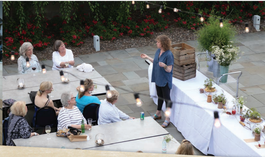
Nordic Table Workshop in ASI's Courtyard (BELOW)