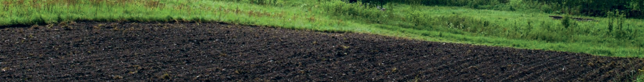
The Watercolor Worlds of Lars Lerin (BELOW)