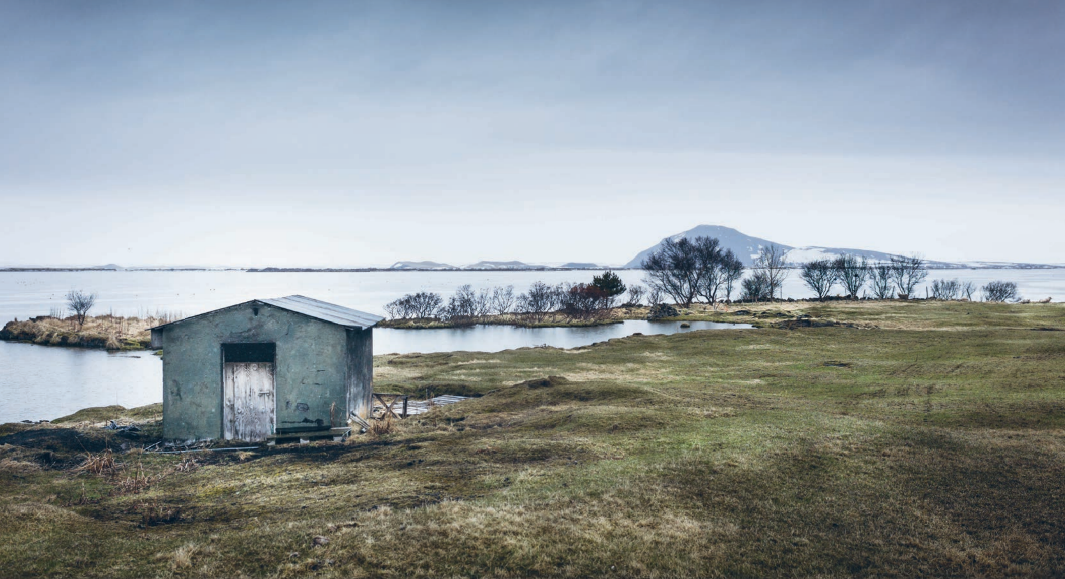
(ABOVE) Traditional Icelandic smokehouse beside Lake Mývatn, Magnus Nilsson 2013