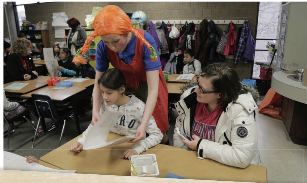
Pippi Celebration at Andersen Elementary School (BELOW)

elders go to Wellstone high school to share food, stories and traditions from the student's cultures. Story Swap is rooted in ASI's mission to be a gathering place to share experiences around culture and migration. The challenges for many new immigrants are daunting and Story Swap serves as an opportunity to address the wellbeing of immigrant students by listening to their experiences and welcoming them to their new home.