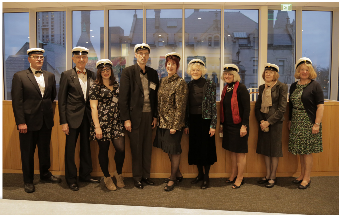
(BELOW) 2015 Volunteers of the year