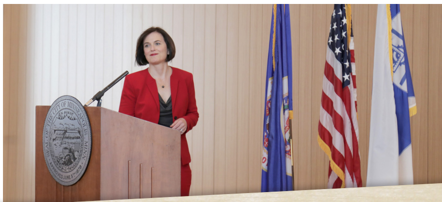
Minneapolis Mayor Betsy Hodges at ASI (BELOW)