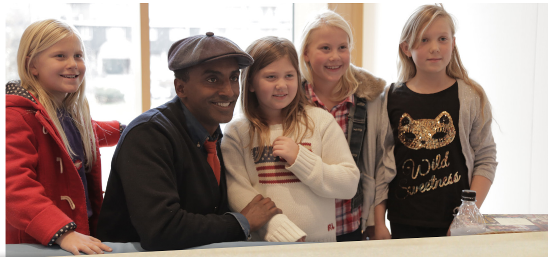
Chef Marcus Samuelsson visits ASI (BELOW)