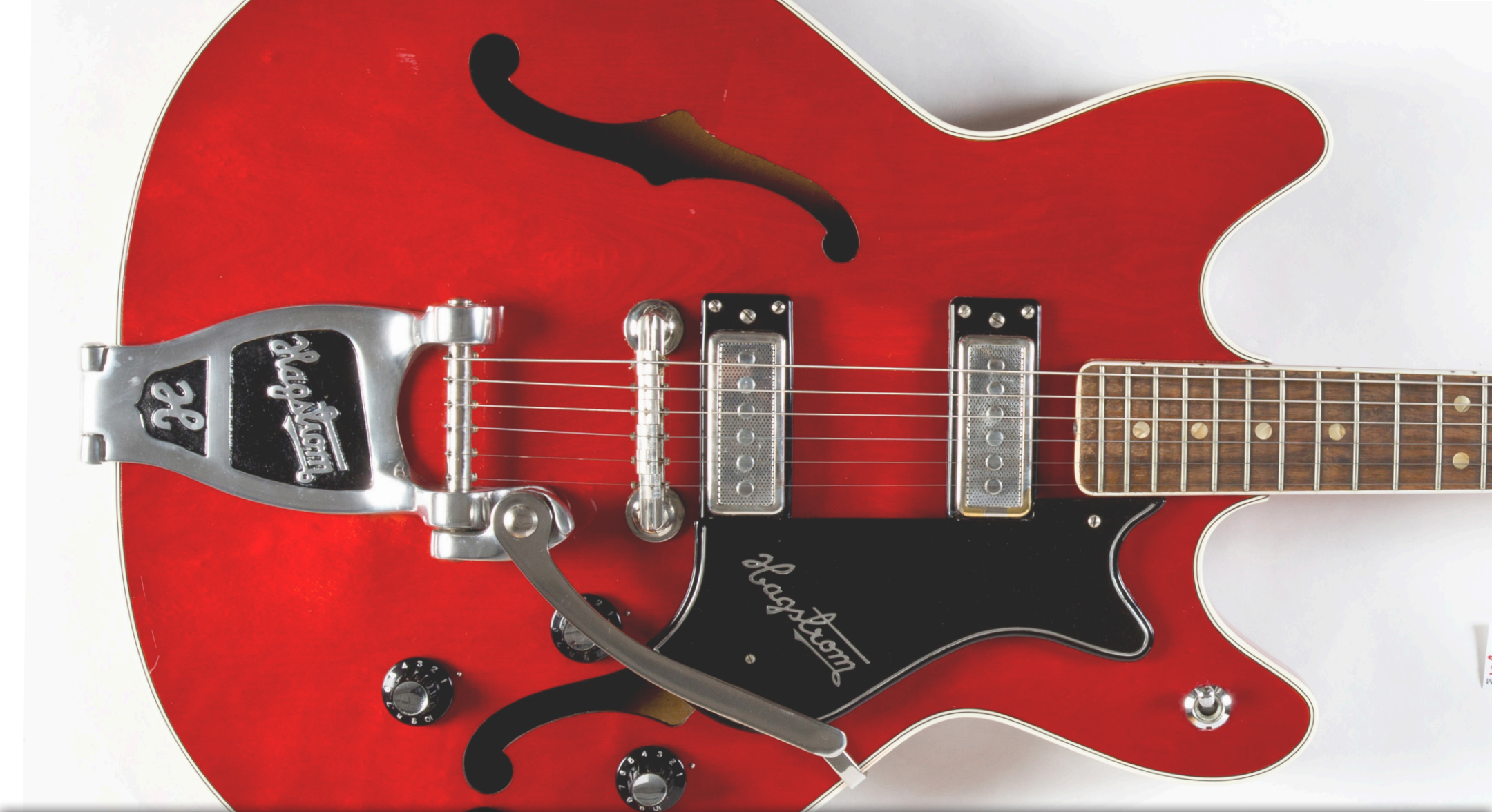
(ABOVE) Hagstrom Viking guitar.