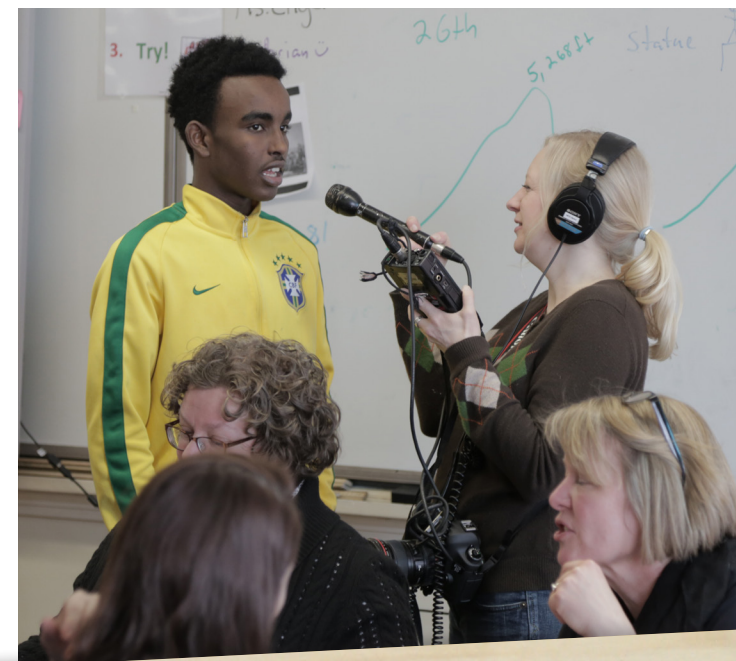
(BELOW) Wellstone Story Swap