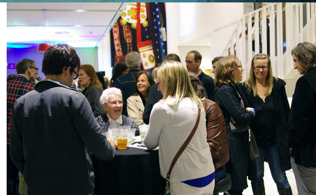
(BOTTOM) Cocktails at the Castle: Loki's Halloween Bash