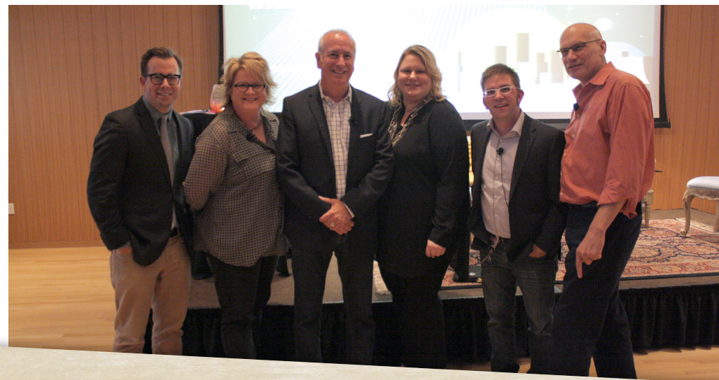
(BELOW) A Night of Social Wonder, (September 2014)

ASI's Cocktails at the Castle series attracted more than 5,000 attendees in its first full year and was recognized as "the museum party done right" by Vita.mn and the "best event concept in the Twin Cities" two years in a row by Minneapolis-St. Paul Magazine . More than 2,000 attended Cocktails at the Castle: Loki's Halloween Bash which took costumed visitors on a journey through the nine worlds of Norse mythology in a creative way.