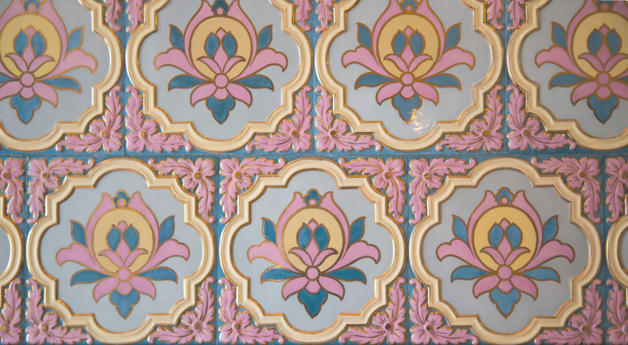
(ABOVE) Detail from one of the Turnblad Mansion kakelugn.