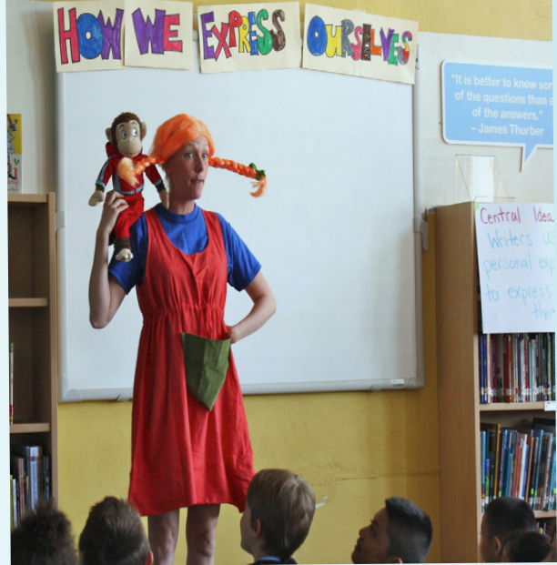
The Pippi Project introduced storytelling and Sweden’s favorite heroine to 300 Minneapolis Public School students