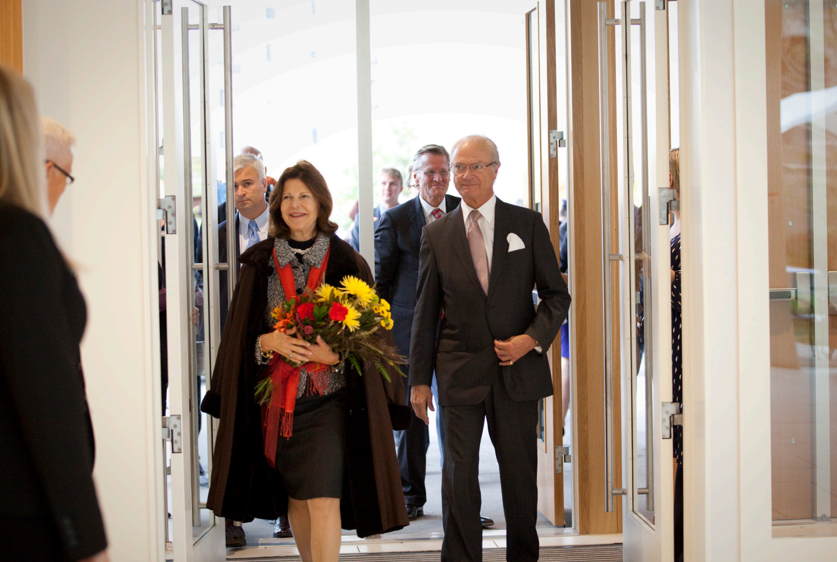
King Carl XVI Gustaf and Queen Silvia of Sweden enter the Nelson Cultural Center.

“The Nelson Cultural Center bridges the past and the present for Swedes who emigrated to America. The American Swedish Institute has been home away from home for the past 82 years. The new cultural center together with the renovations to the Turnblad Mansion strengthens the already vibrant relationship between Sweden and America and the important role played by the American Swedish Institute.”