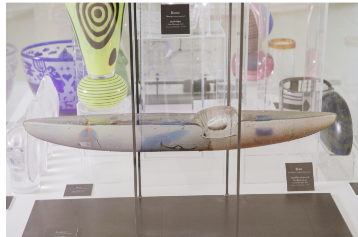
ASI's extensive collection of Swedish Art Glass includes a Bertil Vallien Glass Boat which was exhibited as part of Pull, Twist, Blow — Transforming the Kingdom of Crystal .