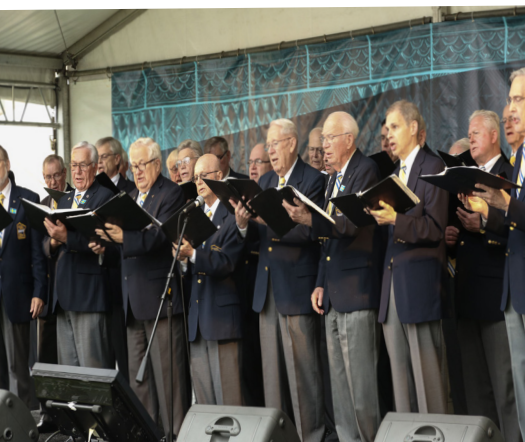
The ASI Male Chorus provided wonderful music at the 2013 ASI Midsommar Celebration.