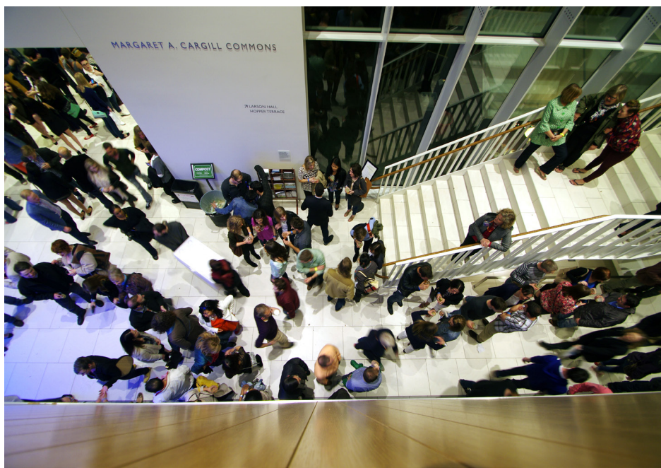
ASI visitors congregate in the Nelson Cultural Center.