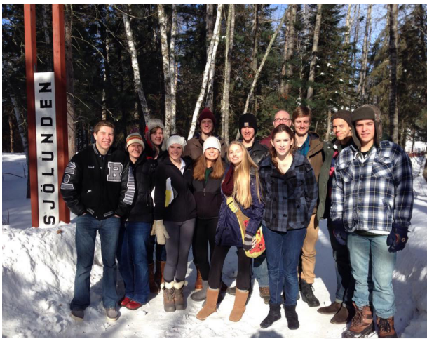
ASI's På Gång teen group blends language and community service.

The new ASI Family Gallery on the third floor of the Turnblad Mansion offers an opportunity for young minds to explore ASI's exhibits and Swedish culture in a space with activities tailored just for them. During Summer 2013, while parents explored the exhibit Pull, Twist, Blow — Transforming the Kingdom of Crystal , kids were able to imagine they were a Swedish glassmaker in Småland.