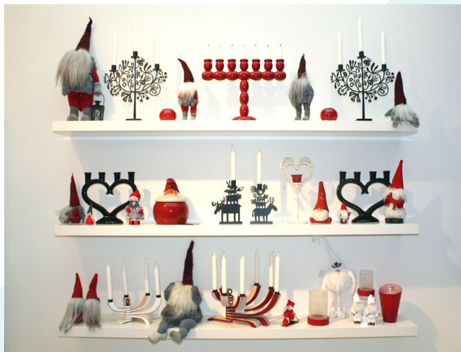
The ASI Museum Shop’s holiday Jul Shop is a go-to destination for all things Tomte.