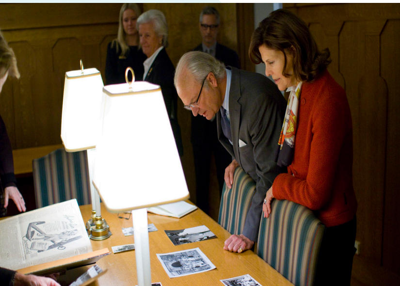
Their Majesties the King and Queen of Sweden visited the Wallenberg Library and Archives, October 2012.

Additionally, ASI was awarded an additional grant from the Minnesota Historical and Cultural Grants Program to catalog our archival material. A primary goal of the project was to make the library and archives collections more accessible to the public; this was accomplished by creating an on-line catalog that has thousands of searchable items. Work continues on the multiyear digitization project to make American Swedish language newspapers available on-line. This includes all extant issues of Svenska Amerikanska Posten. This important project is conducted in partnership with the Swenson Swedish Immigration Research Center, the National Library of Sweden and the Minnesota Historical Society. ASI would like to thank the many individuals who have donated items or have given funding to purchase items to the collections. It is through these gifts that we can create meaningful and memorable experiences for all ASI members and visitors.