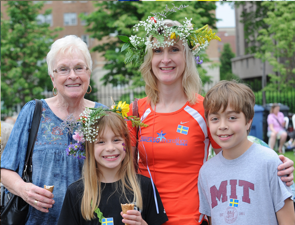
ABOVE: ASI's 2013 Family Day was fun for grandparents, parents and kids alike. LEFT: Waiting to greet the King and Queen of Sweden at ASI. RIGHT: ASI's Midsommar Celebration was a wonderful day honoring Swedish traditions and making new family memories.