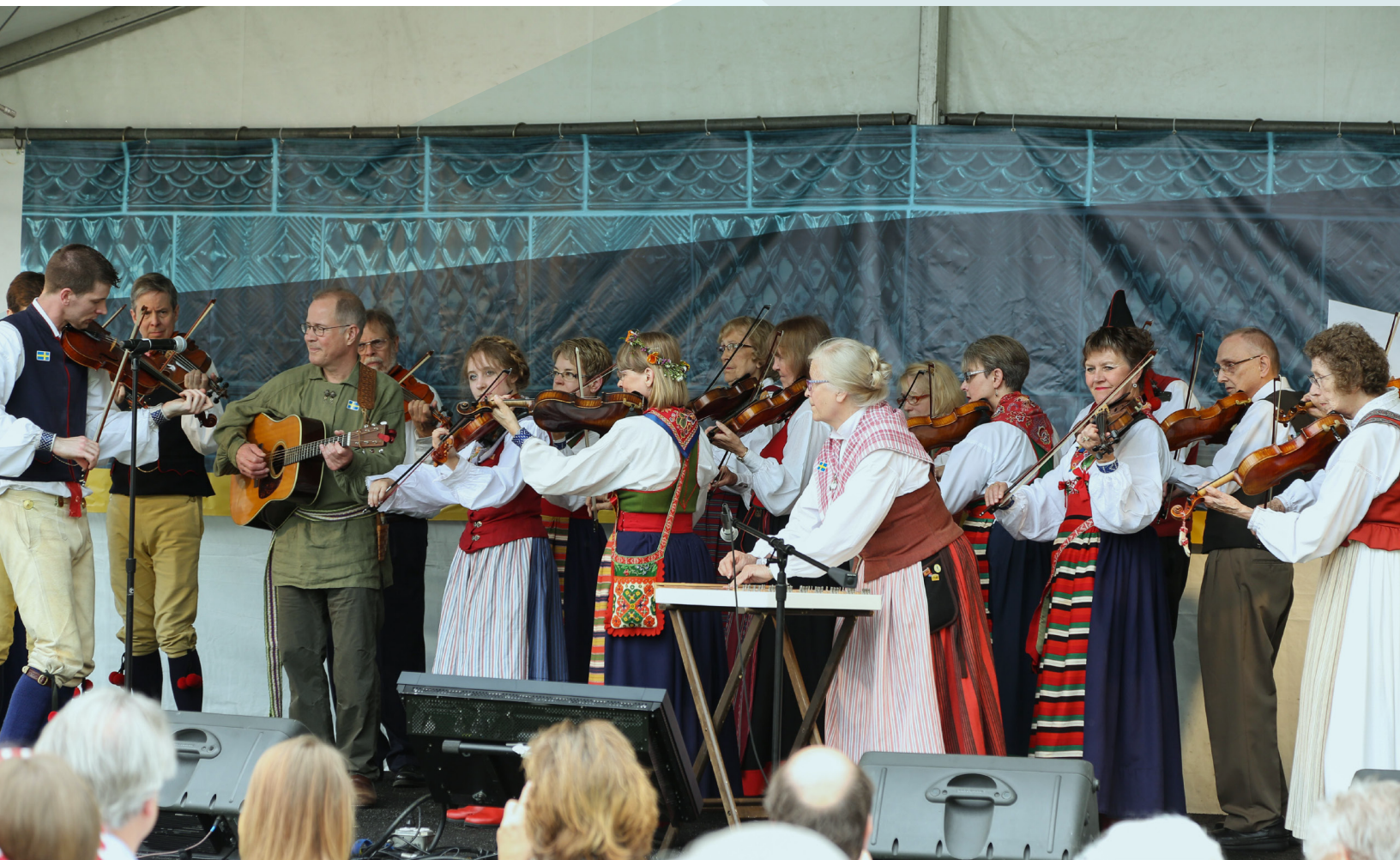
The ASI Spelmanslag performed at ASI Midsommar Celebration in 2013.

Gifts made by Heritage Society members ensure ASI will be able to share Swedish traditions with many generations to come.